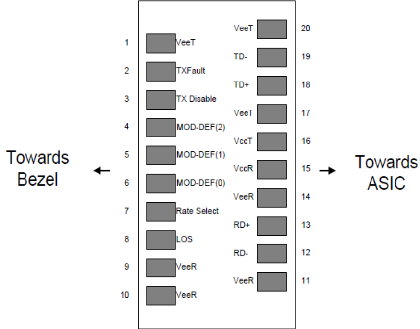
Figure 1. Diagram of host board connector block pin numbers and names